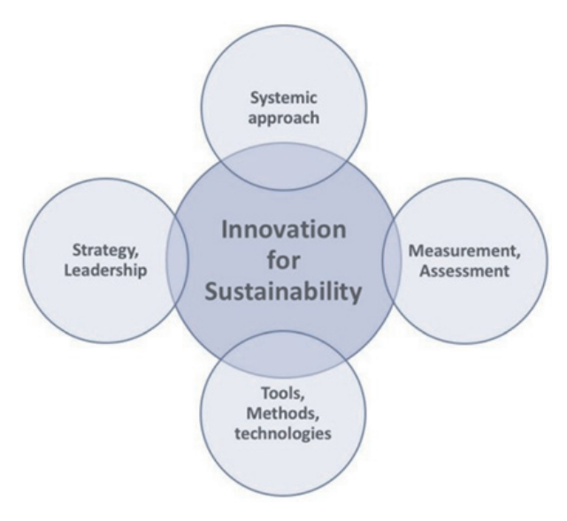
Fig. 1. Understanding frameworks for using innovation for the benefit of sustainability

innovation, seems to be compulsory to inspire joint efforts. Transformational ethical leadership is found in many examples of sustainable innovations that are developed, in many cases, by the challenges in adopting sustainability itself (Verburg, 2019).